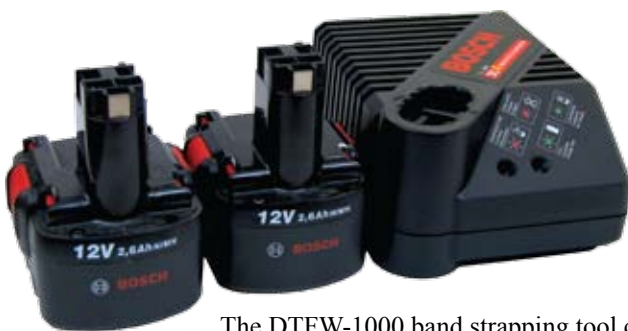
The DTFW-1000 band strapping tool comes with 2 batteries and a charger