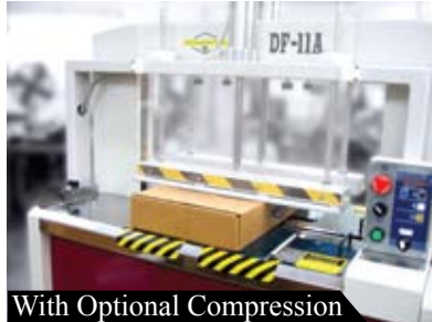
With Optional Compression

The DF-11A fully automatic strapping machine can be integrated into an existing conveyor system to automate your carton sealing process.