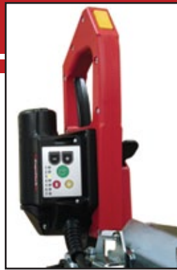
Battery Powered Friction Weld Hand Tool

Built-in "hands free" cutter easily cuts polypropylene or polyester strap effortlessly.